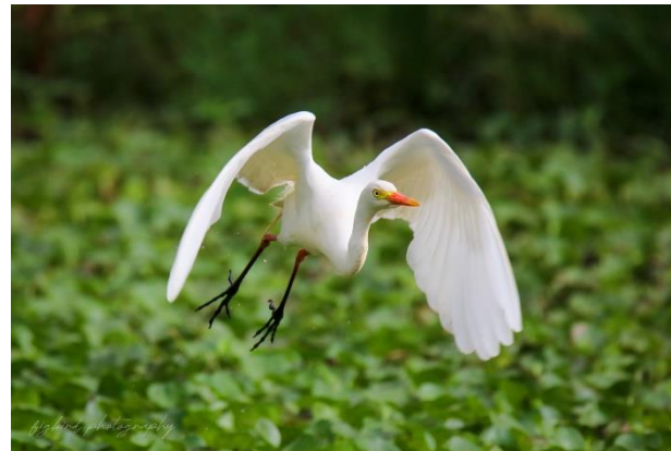
Egrets lift their wings to startle water creatures. Medium Egrets young leave the nest after 60-70 days.