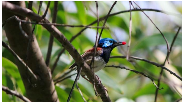
Variegated Fairy-wren having found a red berry, possibly from a Brazilian Nightshade.