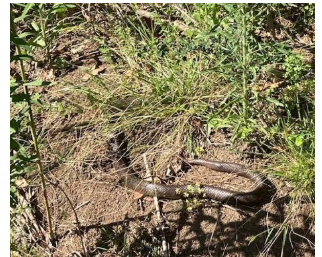
Eastern Brown Snake is the second most venomous snake in the world. Will attack if provoked. Usually shy and inactive for 90% of the time.