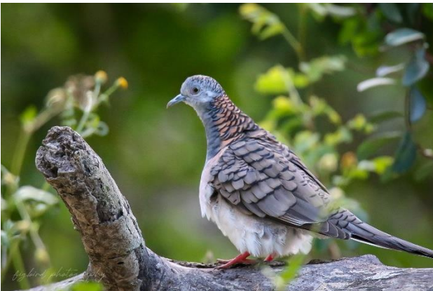
Bar-shouldered Dove . Feeds on seeds on the ground. Displays chestnut panels on wings and white tail tips in flight. Photo: Zara Bailey

Is distinguished by its orange spot near the eye. This kingfisher eats reptiles and lizards and nests in tree hollows and bank burrows. Photo: Zara Bailey.