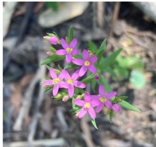
Spiked Centaury Schenkia australis . Masses found near Stony Gully.

Since the flood and the spring rains, there have been exciting appearances of native plants.