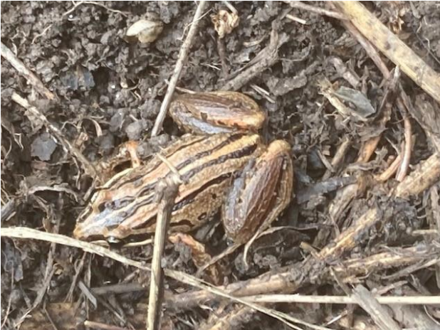
This Striped Marsh Frog emerged from a mass of Dychoriste . This hardy frog likes leaf litter and can be recognised by its 'Tok Tok' call.