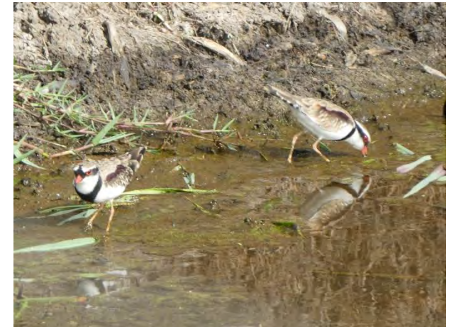
Black-fronted Dotterel are usually at the water's edge at the first lagoon. MS