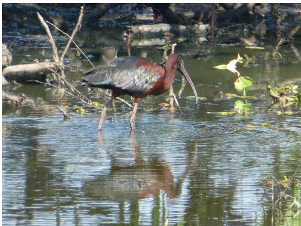
Several Glossy Ibis have been at the lagoon for the last few months. This one was feeding beside a Little Egret and two White Ibises. MS