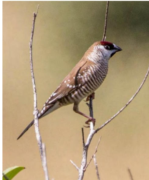
Plum-headed finch captured by Sean Nolan.

The dry weather and the heat have made this a very difficult time for birds, as insect populations are greatly reduced. However, Hugh posted 72 sightings on e-bird, an amazing tally during such a dry summer. Of particular interest were the Dollarbirds (juvenile?) near Jagera Corner and the Plum-headed finches on the way to the lagoon.