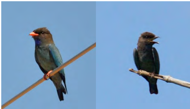
Adult Dollarbird and juvenile, wanting food. The adult photo was not taken at the Common, but there were plenty around when the juvenile was snapped.

Observers of a nesting pair in Mareeba registered both regular foraging and frenzied foraging. During regular foraging the parents delivered 126 meals at an average rate of one every 10 minutes, but during frenzied foraging a total of 347 meals arrived in 252 minutes. That is a rate of 1.4 meals per minute. The frenzied feeding consisted of single termites. ( Wingspan March 2006 p18 Clarkson & Clarkson)