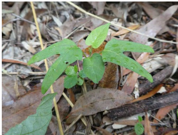
This Ipomoea plebeia shows the unusual indentations on the seedling leaf.

Known as Bell Vine, this plant was first found in Stoney Gully, but can now be found further afield.