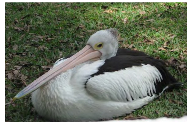
This Atherton Tableland pelican settled down close enough to show its topknot.