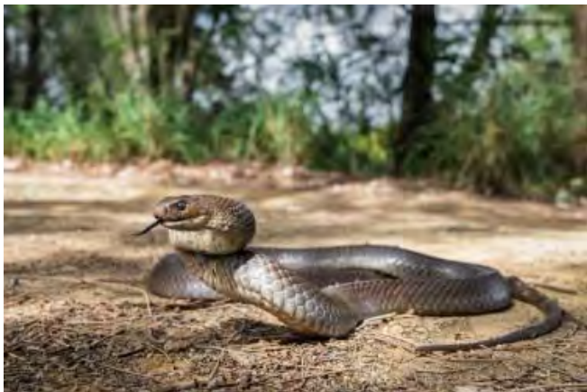
Jan Bartonik, a keen observer of snakes, supplied these photos of a Red-bellied black and Eastern browns.