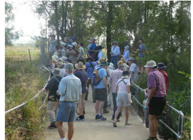
The second culvert usually rewards birdwatchers.

shares his enthusiasm and knowledge. Birdwatchers learn so much from his tips on identification, location and behaviour.