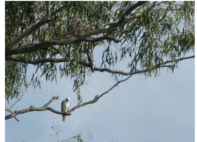
This Black-shouldered kite had captured the group's attention. MS