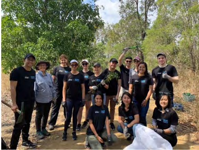
Working out of the office.

Thanks to OCCA's Partnership team, a group of about 50 people from KPMG worked at the Common in October. Some volunteers established a large planting beside one of the University plots, while others weeded and collected tree guards.