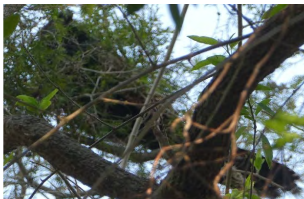
Where can a Pheasant Coucal get some privacy?