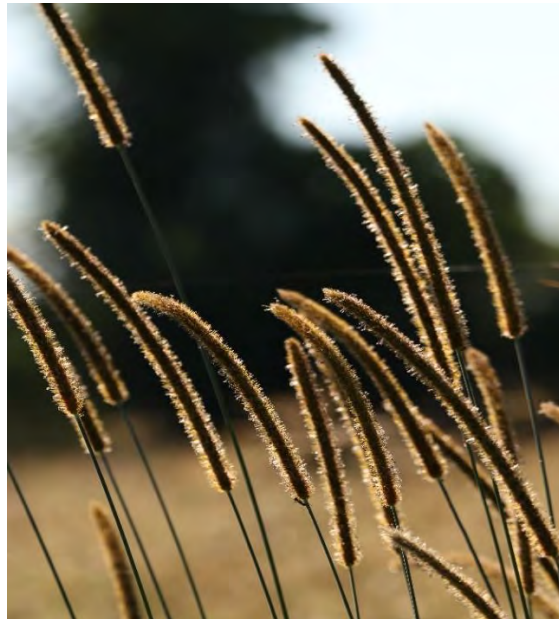
Slender pigeon grass, Setaria parvifolia.

Friends of Oxley Creek Common Inc. represents a broad range of individuals and community groups that have shared visions in educational, social, ecological and agricultural sustainability.