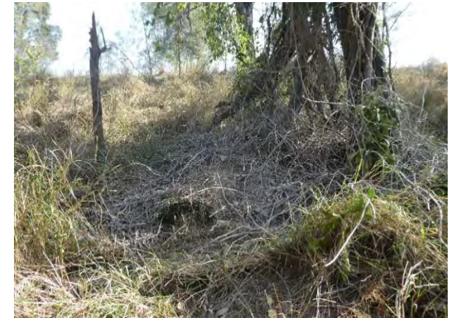
This untidy looking pile is home to Quail.