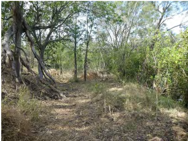
Cleared space for Mangroves and Phragmites to spread.

We have been working at two sites on the creek bank: south of Commelina Gully near the large casuarina and just south of Stoney Gully. The first site looked like a relatively easy place to work but proved very difficult. The Asparagus Fern was entangled in the Cockspur and was very difficult to remove. The weeds on this site had prevented anything from growing, except for one struggling Tuckeroo.