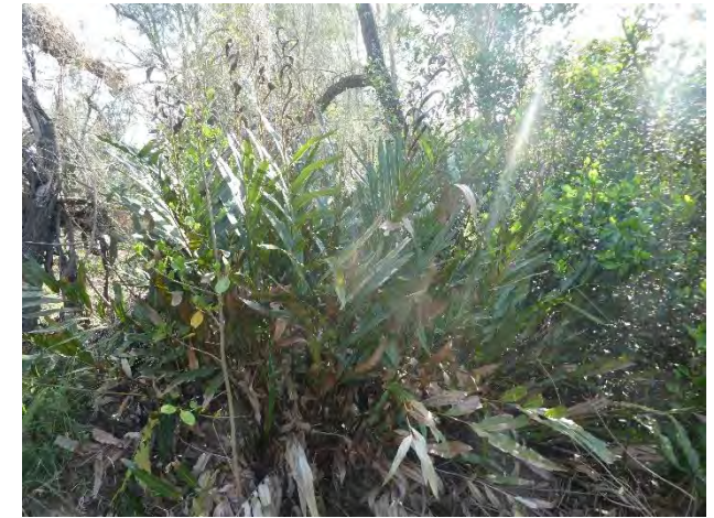
Mangrove Fern has come to life in Fern Gully.

Congratulations to this dauntless band of workers.