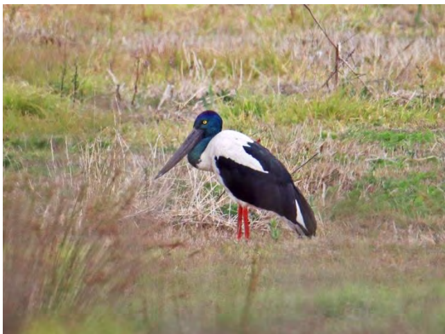
Kevin Habbit was lucky enough to be at the lagoon when the Jabiru was there.

Long-billed Corellas have been sighted feeding in the paddocks with their cousins, the Little Corellas. Long-billed Corellas are distinguishable by a red crescent on the neck and red feathers behind the bill. Once, found only in south-west Victoria, they can now be found in coastal NSW and Queensland.