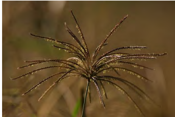
Rhodes grass, Chloris gayana , was introduced to Australia as cattle fodder.

Although regarded as weeds, there is such a shortage of food that birds welcome any seeds.