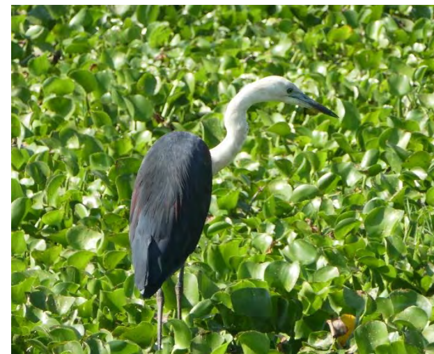
One of the two White-necked Heron on the look-out for food. Notice the maroon feathers.