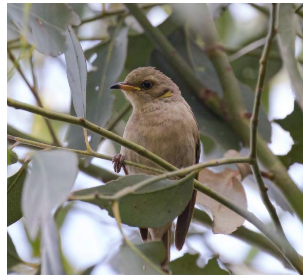
Aidan Byrne captured this Fuscous Honeyeater.