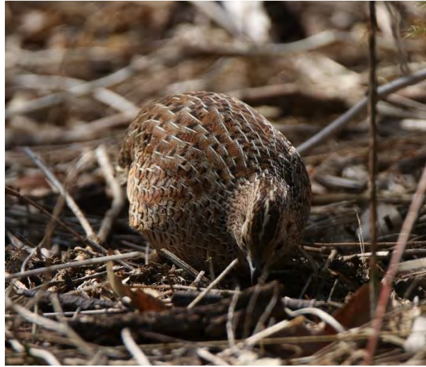
A Brown Quail's white streaks highlighted by the sun.

space will make these ground dwellers vulnerable to prey.