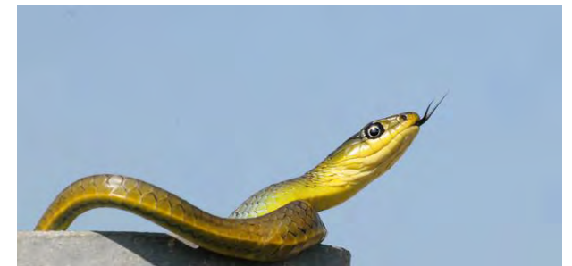
When this snake emerged from a hollow steel gate-post, it was a metre long.