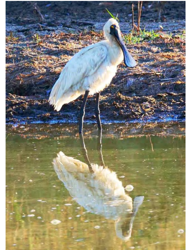
This photo of a Royal Spoonbill captures the rarely seen yellow patch above the eye and the textured bill.

Two weevil species and two moth species from South America have been introduced into Queensland, and have been multiplied, ready for distribution, at the old Sewage Treatment Works, Bowhill Road, Durack. These insects are being distributed by officers of Bio-security and the Brisbane City Council to infestations across Brisbane, including Jabiru Lagoon at Oxley Creek Common.