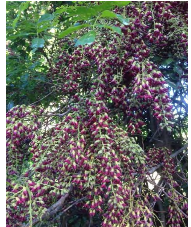
In flower, this Austroteenisia blackii , or Blood Vine demonstrated just how far it has wound its way through the neighbouring trees.