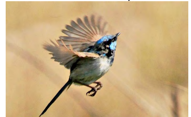
A Superb Fairy-Wren.