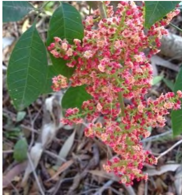
This flowering Rhodosphaera rhodantha is a pollarded specimen, which may have regrown after storm damage.