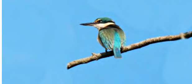
Sacred Kingfisher

gather every Tuesday in the car park to begin at 7 am. New members welcome.