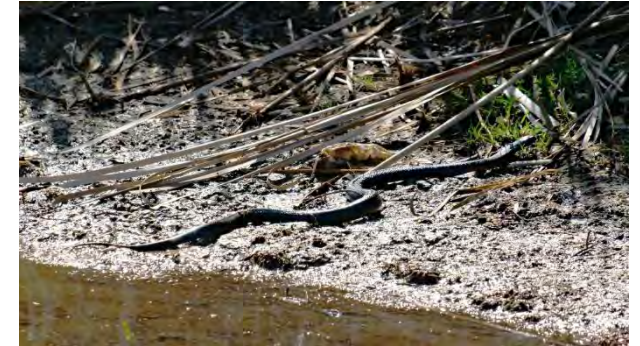
This red-bellied black snake was heading out of the small pool near Pelican Lagoon.