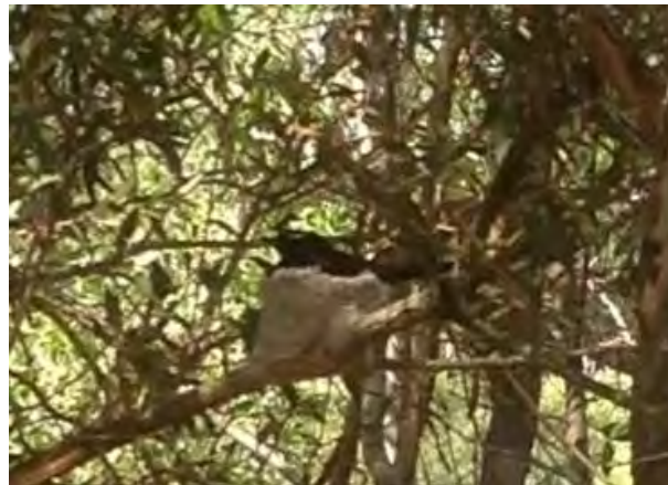
These expectant parents spent some time attacking a kookaburra, they thought was too close to the nest.