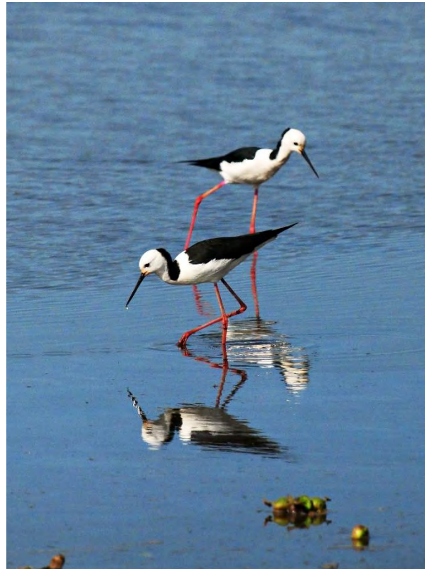
Black-winged Stilts enjoying some of the weed-free water.

Australia is home to six of the world's 11 woodswallow species. Rachel Sims, in her PhD research on co-operative breeding, noticed that the parents of three fledgling woodswallows urged their offspring to clumsily move more than 100 metres to join another family. Both sets of parents then provided coordinated care to this newly formed 'creche'. 'Wingspan' Vol 16, No 4 2006.