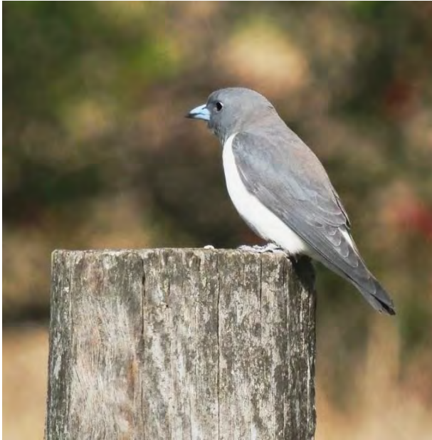
This immature White-breasted Woodswallow is still showing the buff tips to the upper feathers. This species of woodswallow is the only one that has a white rump and a dark undertail, without any white tips.

Australia is home to six of the world's 11 woodswallow species. Rachel Sims, in her PhD research on co-operative breeding, noticed that the parents of three fledgling woodswallows urged their offspring to clumsily move more than 100 metres to join another family. Both sets of parents then provided coordinated care to this newly formed 'creche'. 'Wingspan' Vol 16, No 4 2006.