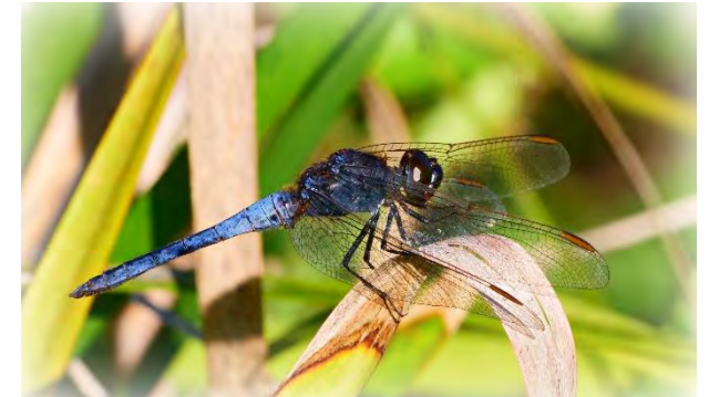
A dragonfly captured by Kevin Fairley.