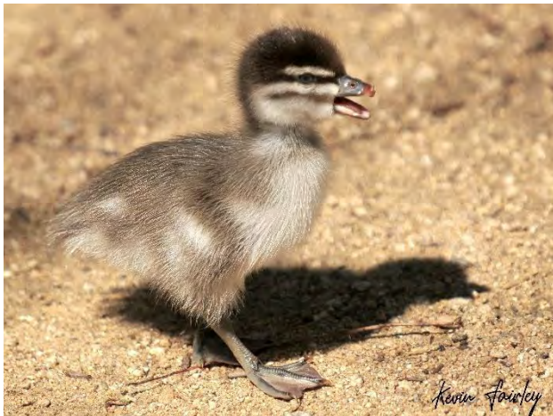
Baby Pacific Black Duck.