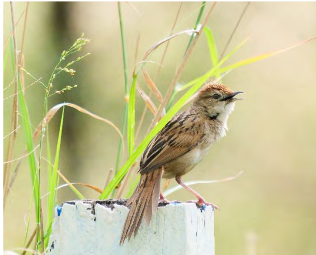
Golden headed Cisticola.