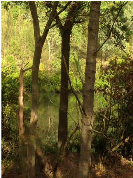
A peaceful moment on the creek bank.