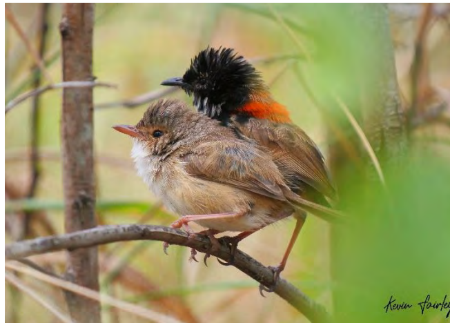
Male and female Red-backed Fairy wrens.