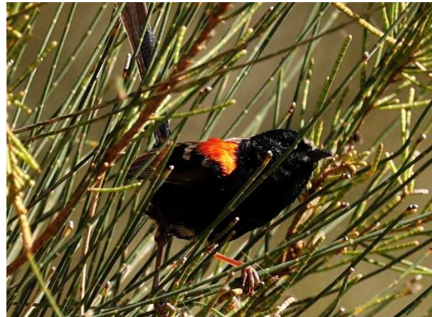
Red-backed Fairy-wren