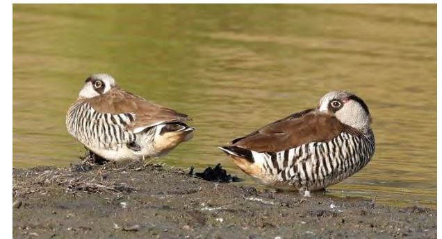
Pink-eared ducks