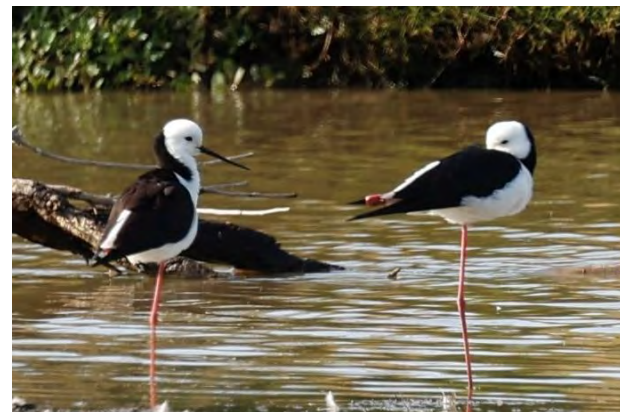
Black-winged Stilt

This shot allows us to see the white strip on the stilt's back and the black ridge at the back of the neck. In flight, the long legs trail behind. Stilts nest on islands and at the shore. If their chicks are threatened, they give off loud 'yelps'.