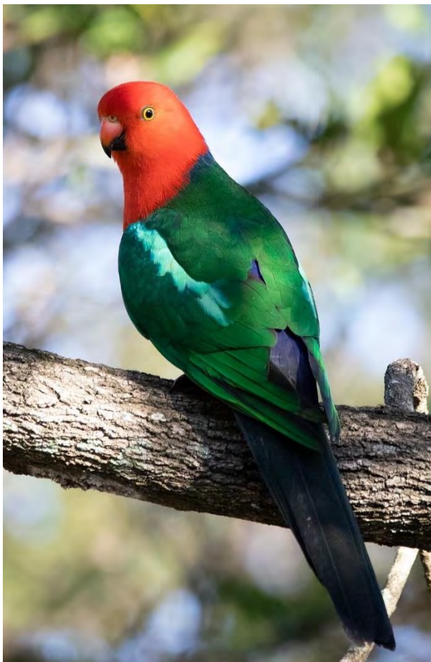
Male King-Parrot

Australian King-Parrots are not regular visitors to the Common. However, several were sighted when this photo was taken. They feed on seeds, fruit, blossoms and insects and will crack open tiny seeds. The female has a dark green head and chest and they choose deep hollows in eucalypts for nests. The female tends the nestlings for the first weeks, relying on the male to