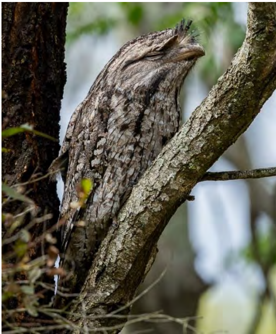
Tawny Frogmouth's excellent camouflage.