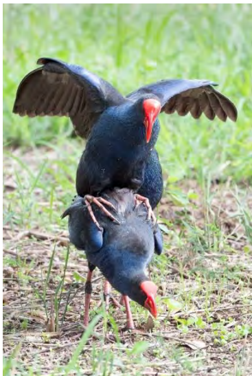
Purple Swamphens are often lurking in the grass near the lagoons. There wasn't enough grass to hide this activity. Hatchlings are black with huge legs and large toes, which develop a spur on the back.

Decaying trees are full of fungi, which are the only organisms that can break down the lignum in wood. The photo below, shows the soft decay, where the organisms have been at work and the 'plates' flowering on the remaining hardwood.