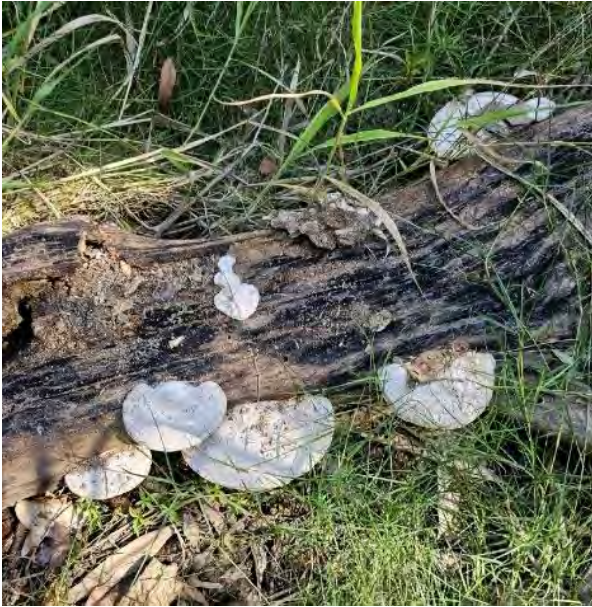
Bracket Fungi

Many plants have a symbiotic relationship with ectomycorrhizal fungi, which wraps itself around the roots and sends out 'fingers' to access nutrients and water. Scientists have discovered that the root fungi in Eucalyptus grandis can control the genetic development of the tree.