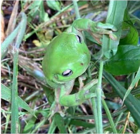
Large Green Tree Frog