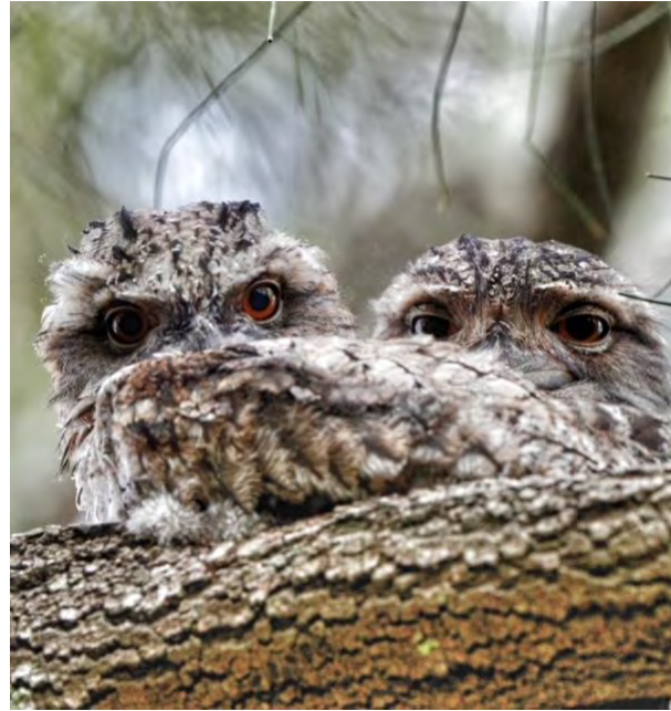
Tawny Frogmouth young, one looking suspicious the other bemused.