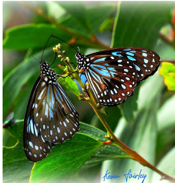
Blue Tiger, although not in the list has been seen at the Common.

Two butterfly surveys were conducted at the Common in September and November, last year.