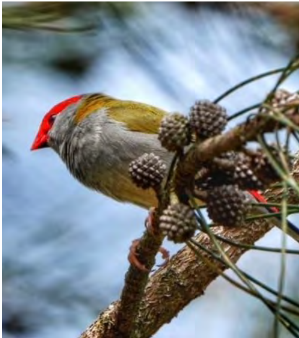
Red-browed Finch