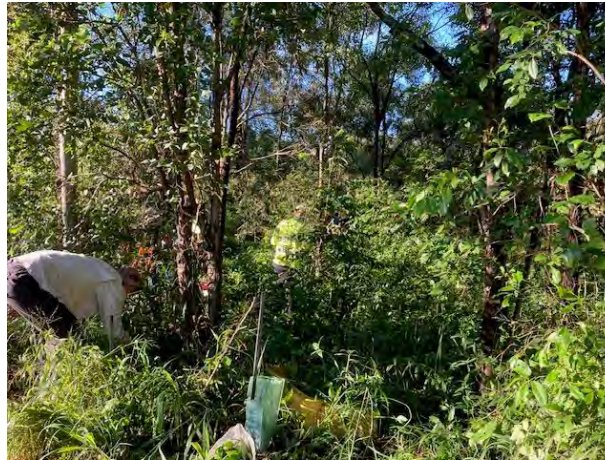
Commelina Gully with weeders obscured by the undergrowth.

Our first task this year is to retrieve our plantings from the inundation of weeds. Apart from a resurgence of Green Panic, invasive Commelina benghalensis is rampant at several sites. New plantings are totally obscured. After the initial challenge of finding last year's plantings, we hope to attack the creekbank between Stony Gully and Commelina Gully.