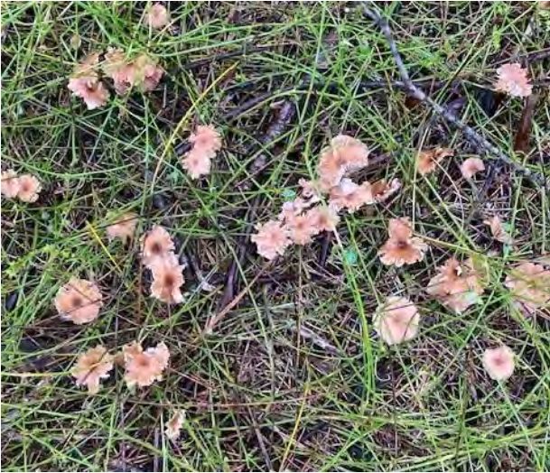
Damp conditions have produced a profusion of fungi at the Common.