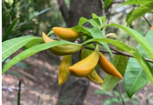
The white 5 petalled, windmill shaped flowers of Tabernaemontana pandacaqui , turn into banana shaped fruit, which will split to reveal poisonous red seeds. This small rainforest tree has relished the wet weather.