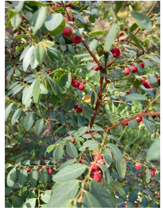
Breynia oblongifolia is fairly prevalent at the Common. However, it is rare to see it covered in fruit, the result of the inconspicuous green flower, which hangs on the stems.

Breynias are home to a variety of insects, such as this shiny beetle. Chewed leaves are a welcome reminder that the insect world is busy feeding.