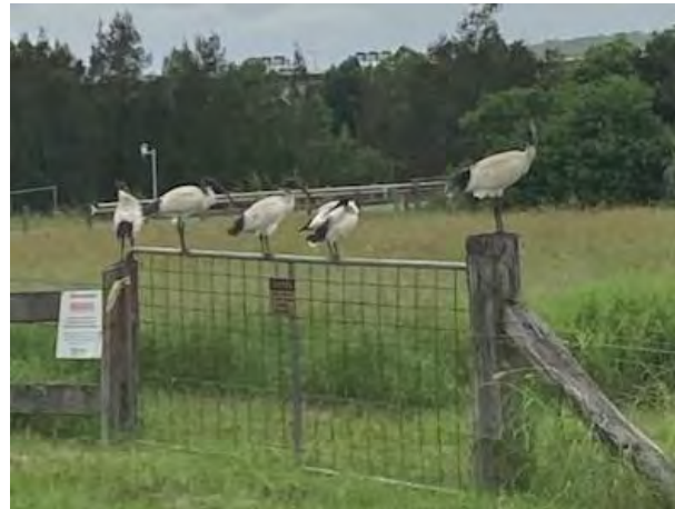
One way for the ibis to dry their feet.