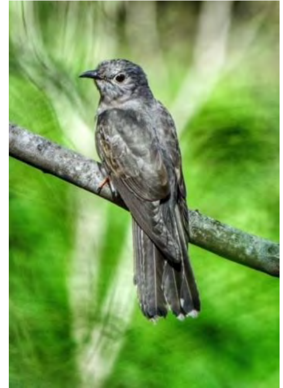
Pallid Cuckoo