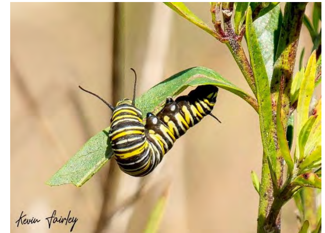
Wanderer caterpillar.

Acacias, Breyntia, Cupaniopsis, the mistletoes and the grasses are hosts for butterflies at the Common. Senna sophora arrived at the Common after the last flood and recent plantings have included Capparis arborea ; Pipturus argenteus ; Cryptocaria sp ; and Dodonea triquetra .