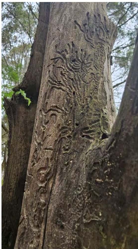
Traces of busy insects.