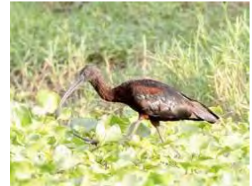
Glossy Ibis