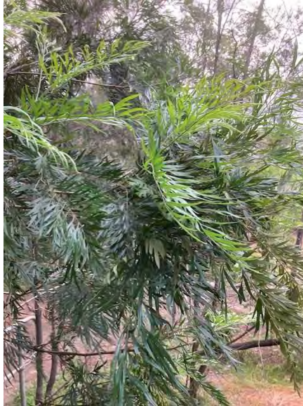
This silky oak, now about 2 metres high, has a flush of new leaves.

Source: Heartwood Rowan Reid p 92-95 Plants of Subtropical Eastern Australia , Andrew Benwell, p 313