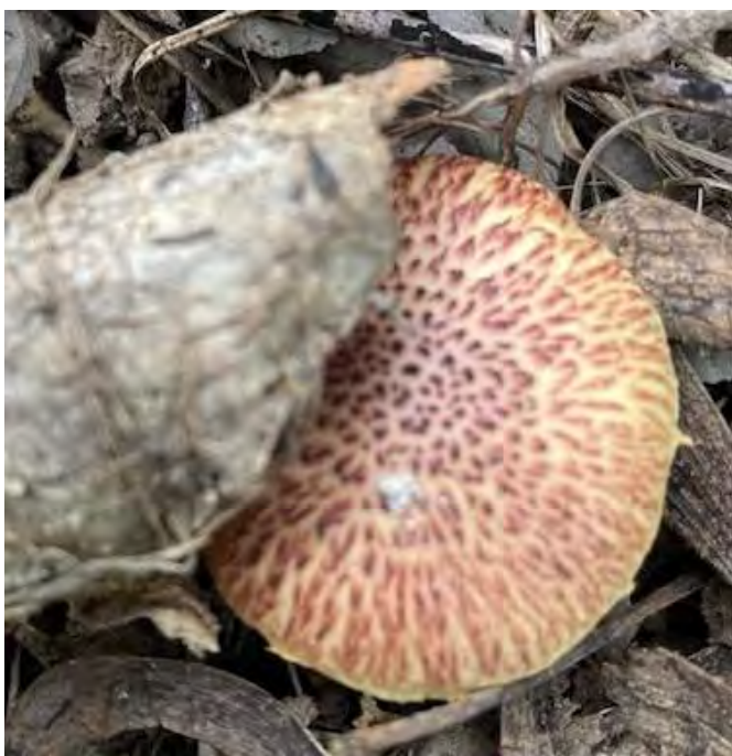
Some of the amazing fungi amongst the leaf litter.