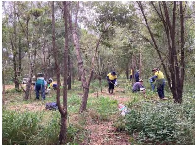
Tuesday Common Carers hard at work at Scrub Wren Point. Below, is an example of the weed explosion.

New members are welcome. Meet this amazing group of people in the car park at 6.45am.